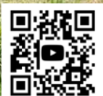
SEE IT IN ACTION!