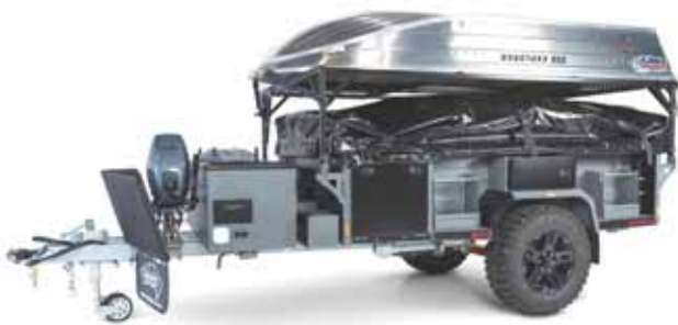
Extenda with optional extras