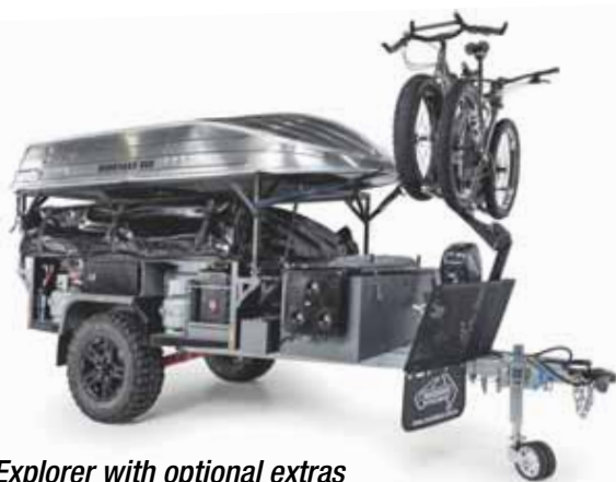
Explorer with optional extras