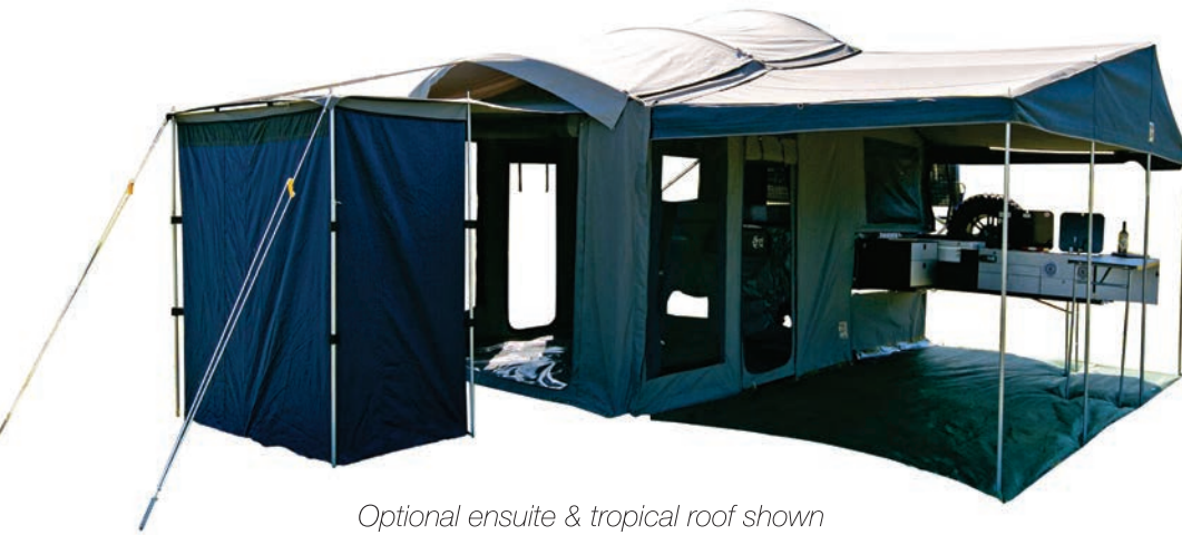
Optional ensuite & tropical roof shown